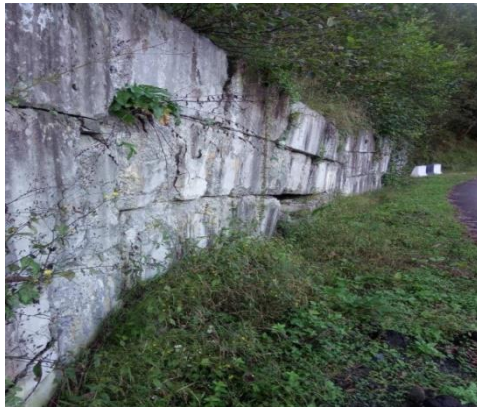
Road km 34+850