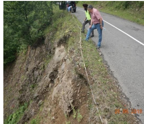
Road km 48+020