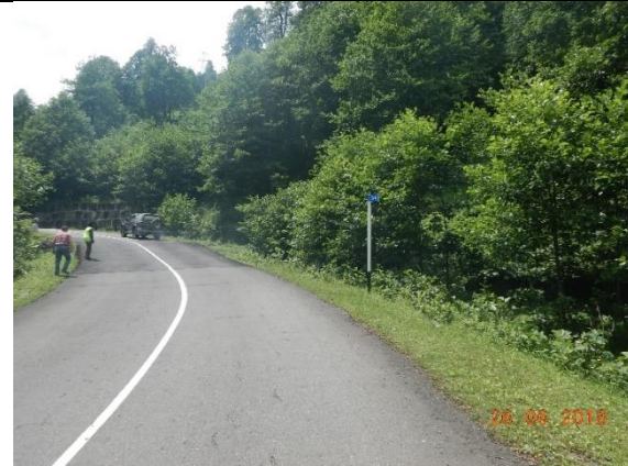
Road km 34+000