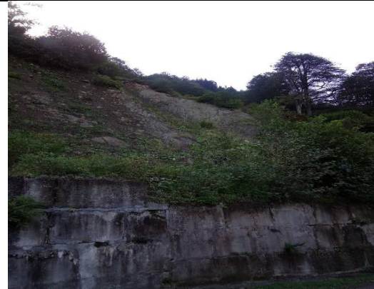
Road km 34+420